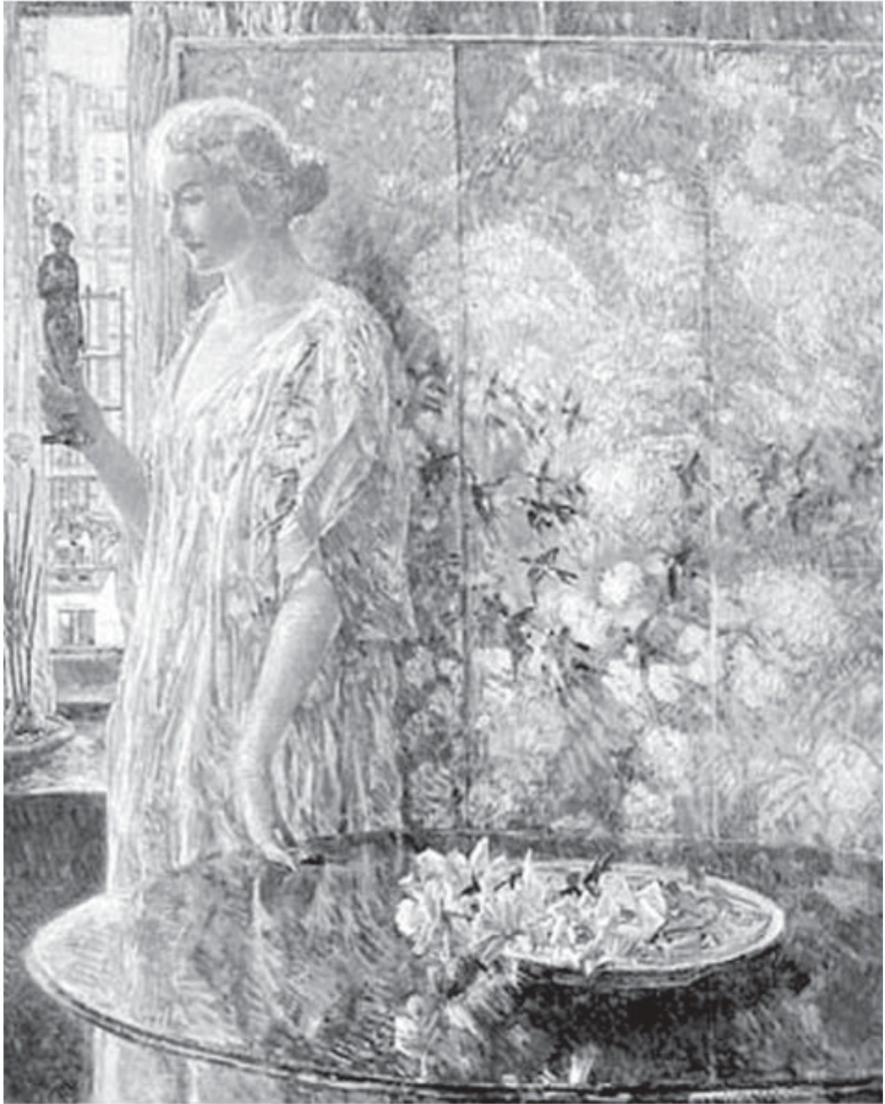
Fig. 5. Tanagra: The Builders , New York, 1918 (detail). National Museum of American Art, Washington, DC.