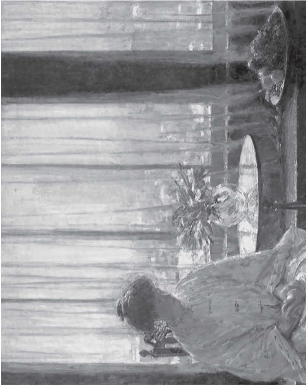
Fig. 2. Breakfast Room, Winter Morning, New York, 1911 (detail). Worcester Art Museum, Worcester.