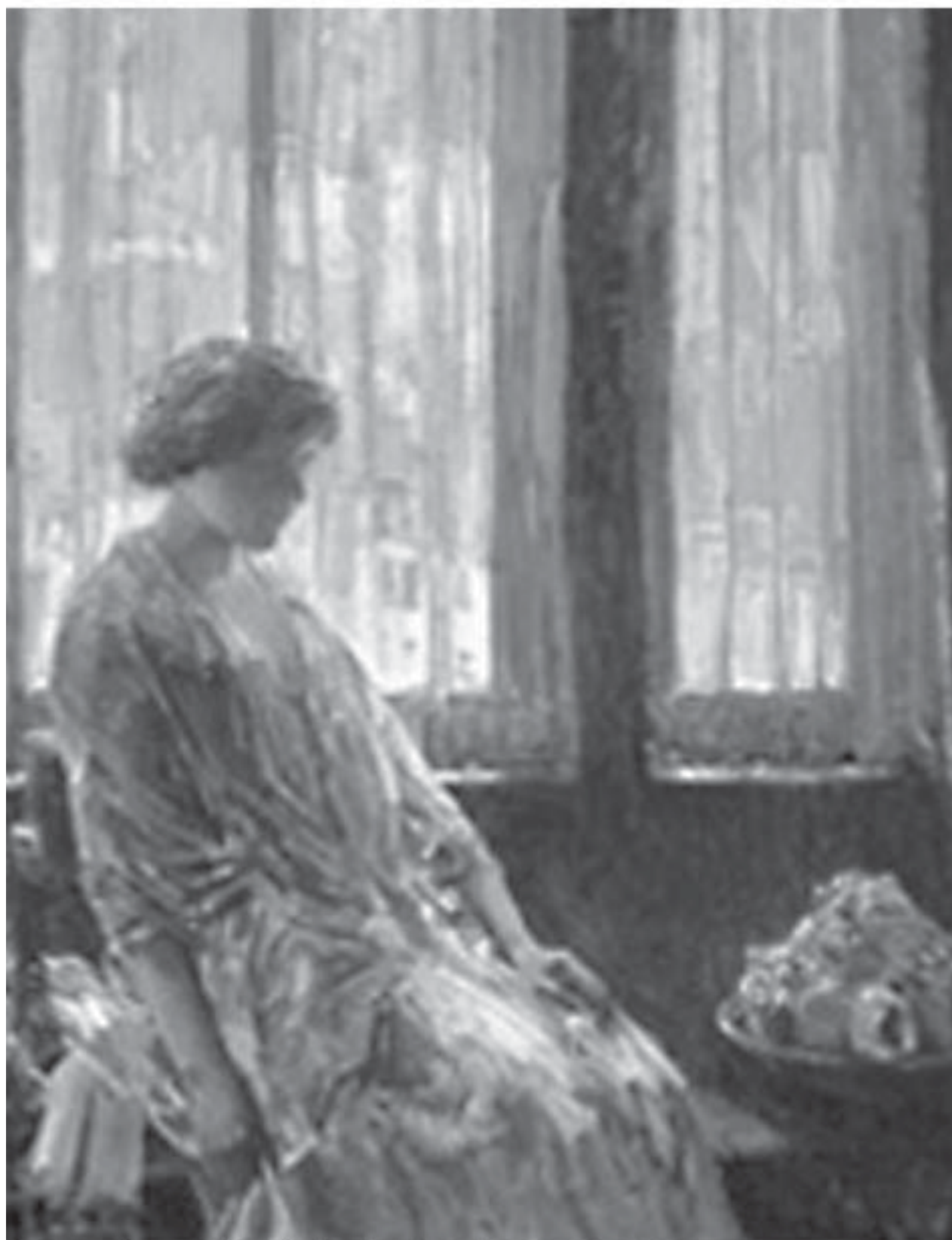
Fig. 3. The New York Window , 1912 (detail). Corcoran Gallery of Art, Washington, DC.