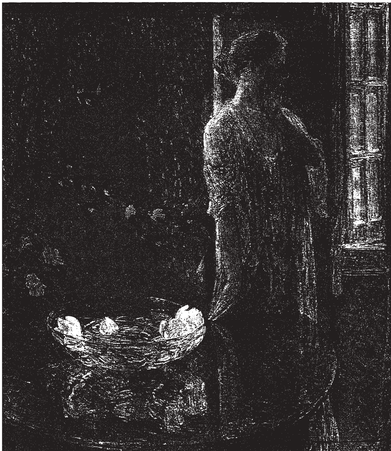
Fig. 6. Spring Morning , 1909 (detail). Carnegie Museum of Art, Pittsburgh.