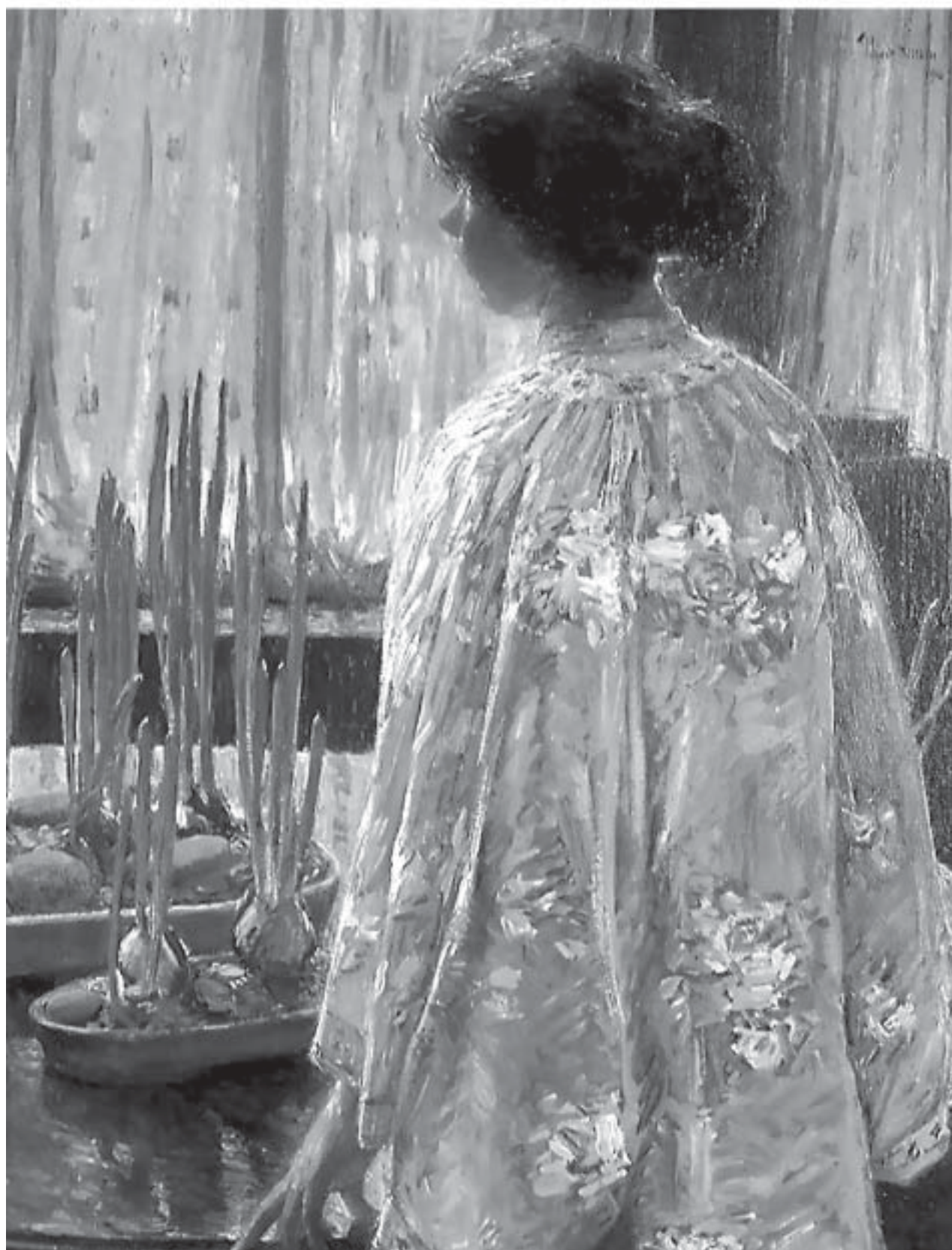
Fig. 1. The Table Garden , 1910 (detail). Mitchell Museum of Cedarhurst, Mt. Vernon, Illinois.