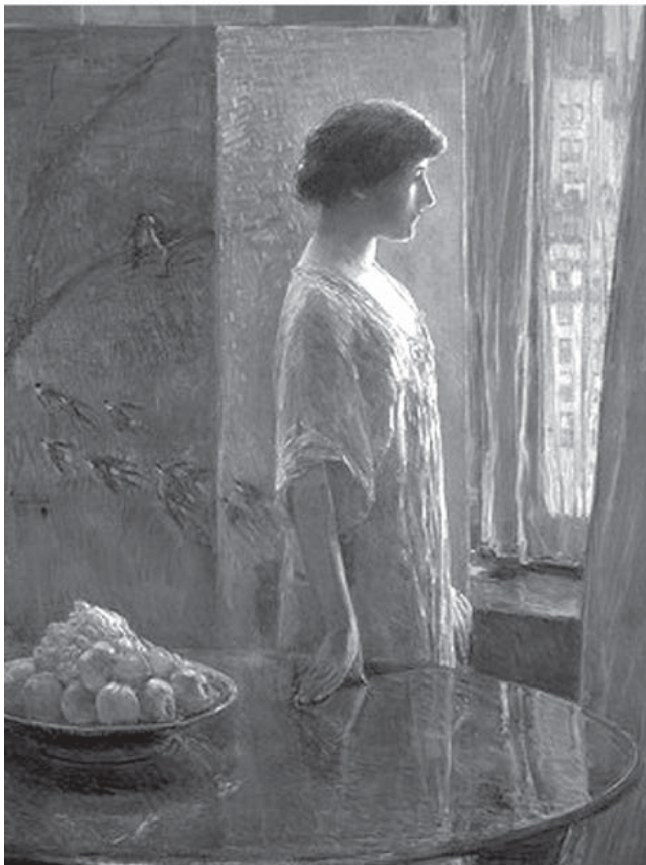
Fig. 7. The East Window , 1913 (detail). Hirshhorn Museum and Sculpture Garden, Washington, DC.